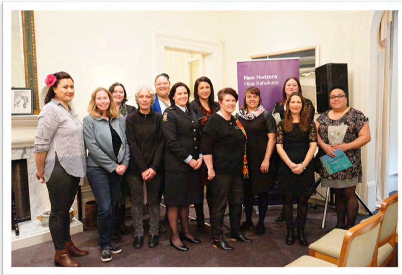
All twelve recipients of awards at the Wellington Ceremony