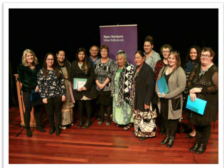
Awardees and friends/whanau at the Palmerston North Awards Ceremony

The Palmerston North Awards Ceremony was held on Friday 22 July at the Globe Theatre, Palmerston North. We presented a record number of awards this year to women undertaking tertiary education at institutions and undertaking research within the Manawatu-Wanganui region – 6 awards for second-chance education, two research awards and two specific purpose awards. Congratulations to all our award